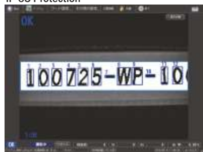
▲ Inspection screen