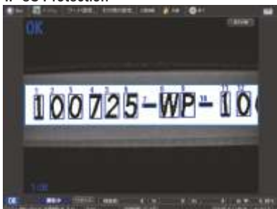
▲ Inspection screen