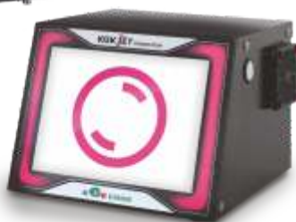
▲ Controller / Lighting / Camera

■ Easy to see on a large screen KGK Jet PK100, inspection settings can be displayed on a single 8-inch monitor screen, empowers you just see the device settings at a glance.